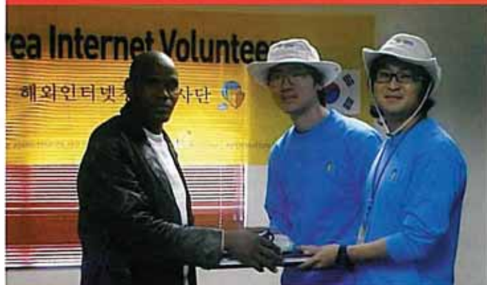
Before the Koreans left for home they decided to donate their laptop to the college. They asked us to take a picture with the whole Central Office staff. The staff gathered in the underground parking to take the picture as one big family.