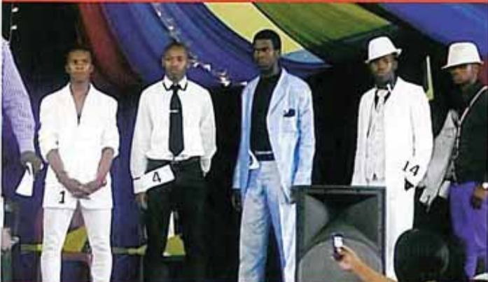
Mr Elangeni contestants (top five) in their formal wear.