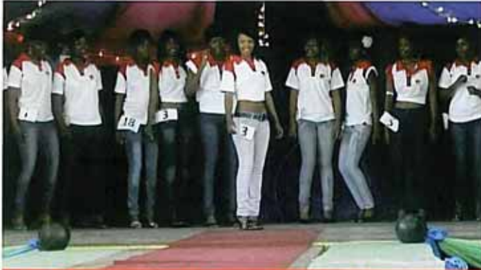
Miss Elangeni contestants in their jeans & college t-shirts.