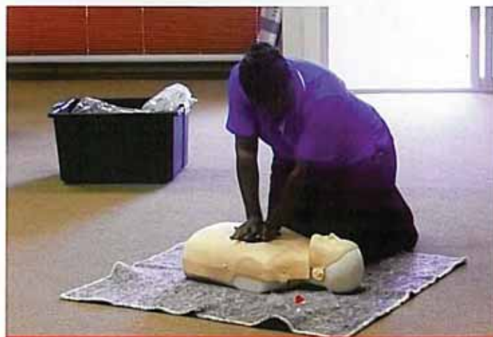
Elangeni staff member gets a lesson in CPR

Elangeni FET College started its regular Emergency Preparedness Programme this year by giving 24 staff the opportunity to participate in a two-day course in Basic First Aid (Level 1).