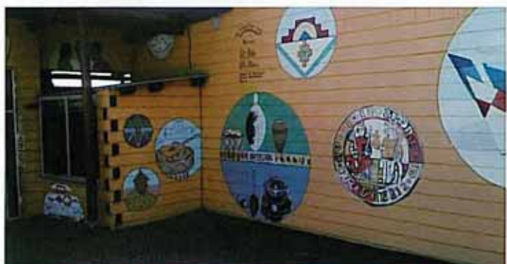
Ekhaya Multi Arts Centre (KwaMashu) where partners, Vibe FM, radio studio is based.