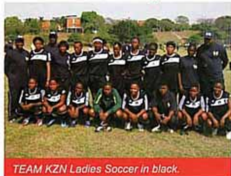
TEAM KZN Ladies Soccer in black.