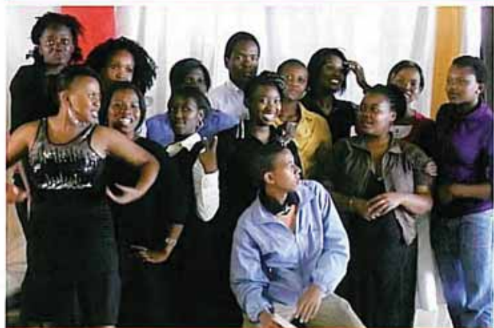
Contestants from all six campuses.