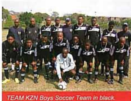
TEAM KZN Boys Soccer Team in black.

The Province of KwaZulu Natal hosted the interprovincial sports tournament organized by SACPO between 24 - 27 September 2010. All provinces were represented except Western Cape and Northern Cape. The selection for the KZN colleges was done from all FET colleges and Elangeni College was represented in Netball, Female and Male Soccer.