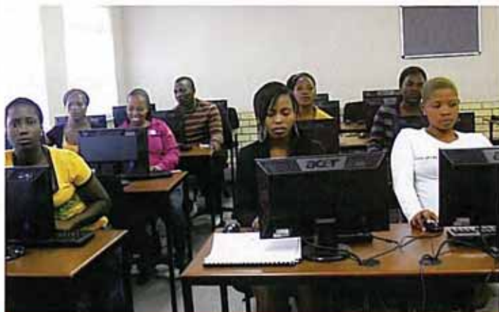
N4 Computer Practice Students of KwaDabeka Campus.

The Campus started operating in July 2010 and the first group of N4 Computer Practice students started their lectures on 10 August 2010.